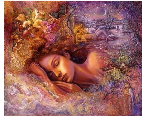
Phenomenal Consciousness (Colors, pains, etc.; dreams)