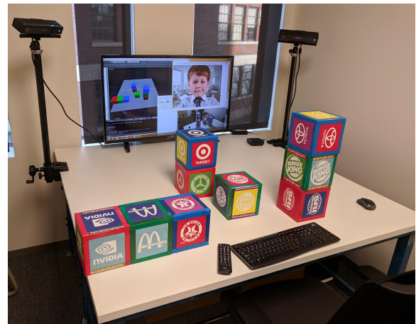
Figure 1: The blocks world apparatus setup.

Our blocks world system consists of two components: the physical apparatus and a blocks world dialogue system 1 . The physical apparatus (see Fig. 1) is comprised of a square table surface, approximately 1.5m x 1.5m in size, several cubical blocks with 0.15m sides, two Microsoft Kinect sensors mounted at the back end of the table to track the state of the world, and a display for user interaction. The blocks are marked with corporate logos, such as McDonald’s, Toyota, Texaco, etc., which serve as block names and allow the user and the system to uniquely identify and refer to individual blocks. The blocks are also color-coded as either red, green, or blue, using the colored stripes running along the edges of the blocks (see the Figure).